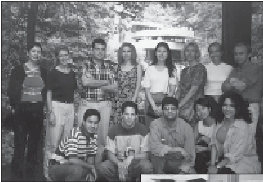
Top Left: Members of LL.M. Class of 1999 on annual visit to Frank Lloyd Wright's Fallingwater