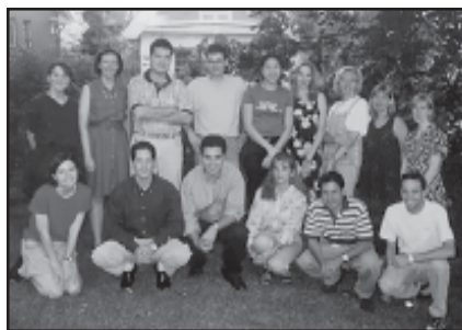
1998 English for Lawyers Program Participants and Faculty