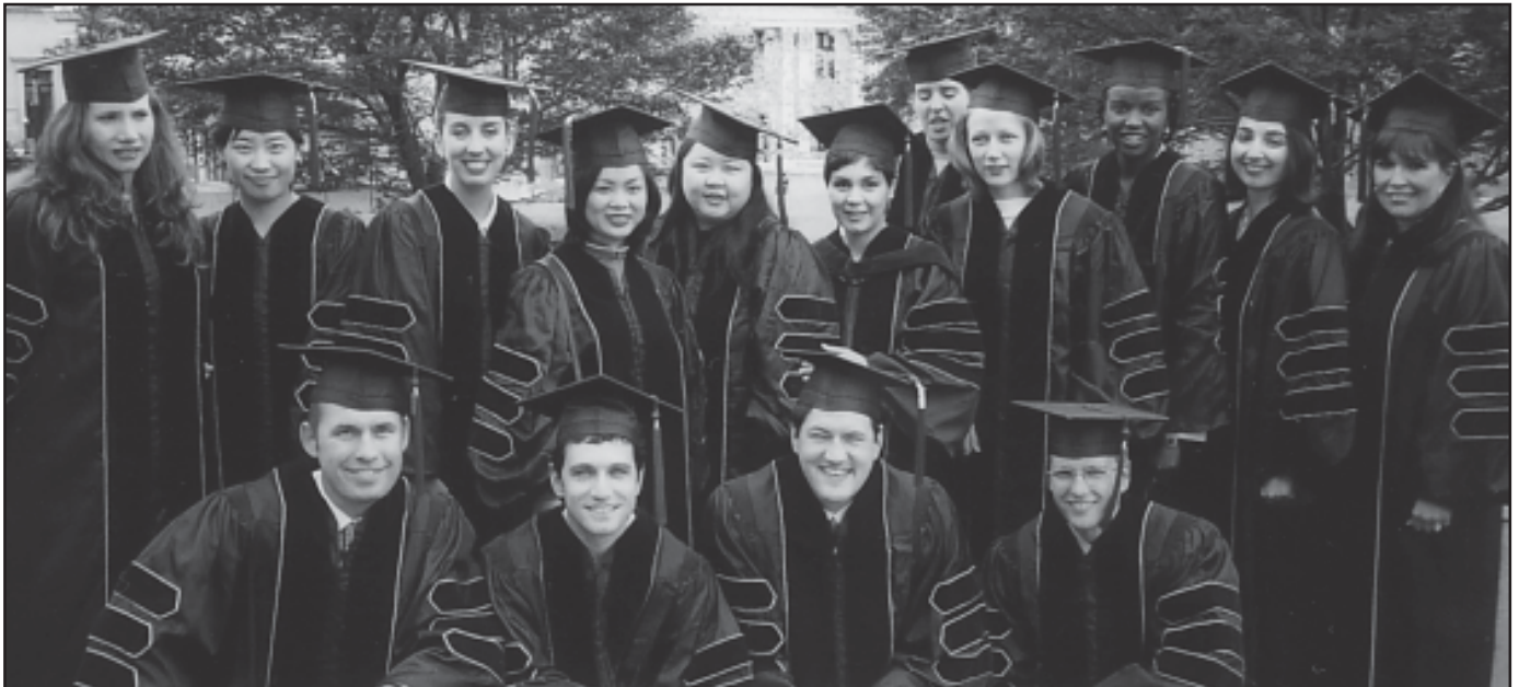
LL.M. Class of 2002

at corporations and law firms including Westinghouse Electric Company, Cohen & Grigsby, Deloitte & Touche, Alcoa, Buchanan Ingersoll, Heinz, and The Center for Constitutional Rights.