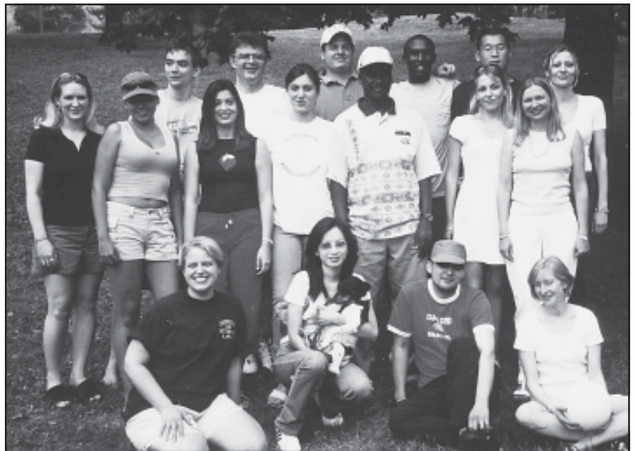
Students prepare for the LL.M. year at the English for Lawyers Program in July 2002