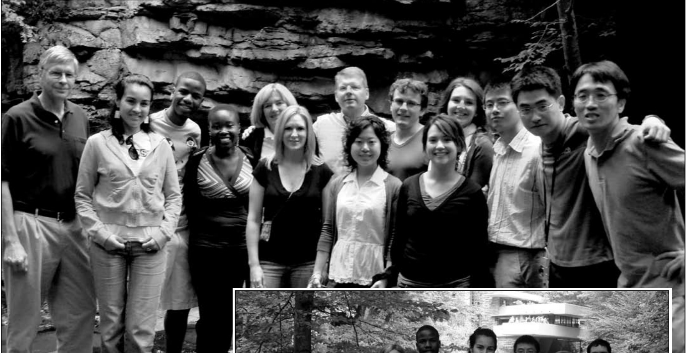
The LL.M. Class of 2009 at the annual trip to the Frank Lloyd Wright house, Fallingwater.