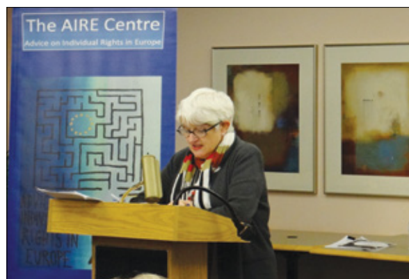
Nuala Mole delivers a lecture on "European Human Rights for Commercial Lawyers" at Pitt's School of Law, October 2013

voting rights, and extra-territoriality and military operations. On October 17, she lectured to the public on "European Human Rights for Commercial Lawyers." Mole has conducted training for the Council of Europe, the European Commission, and the AIRE Centre for judges, public officials, lawyers, and NGOs in 40 of the 47 Member States of the Council of Europe. ♦