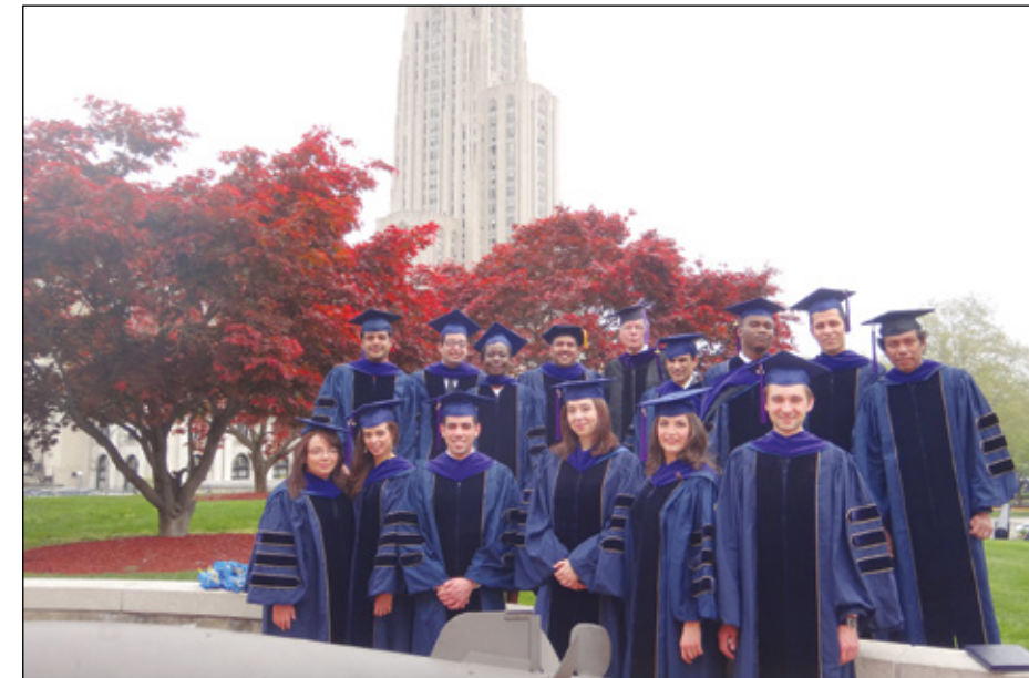
The LLM Class of 2014