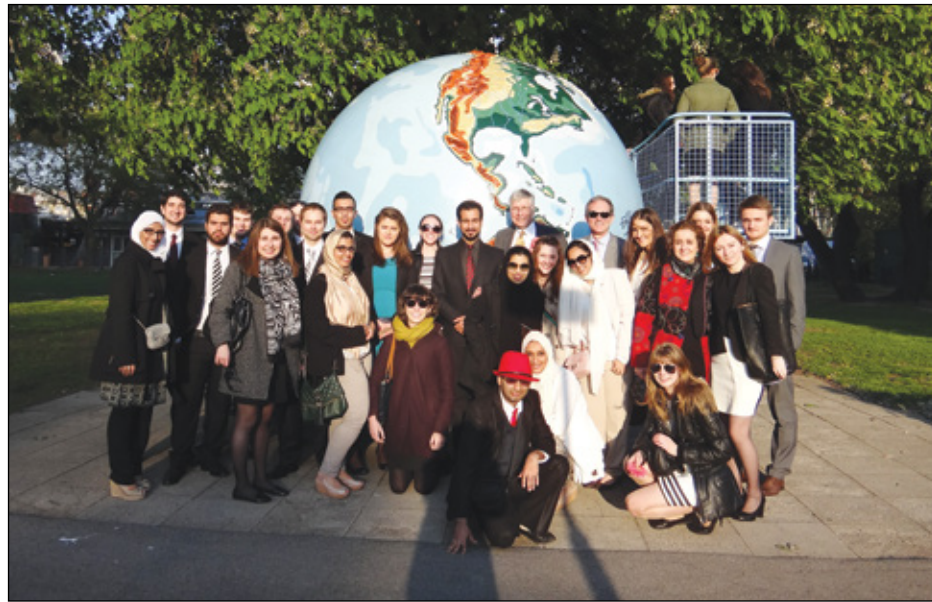
Members of the Pitt Consortium enjoy a break from the Vis Moot at the Prater in Vienna, Austria, April 2012