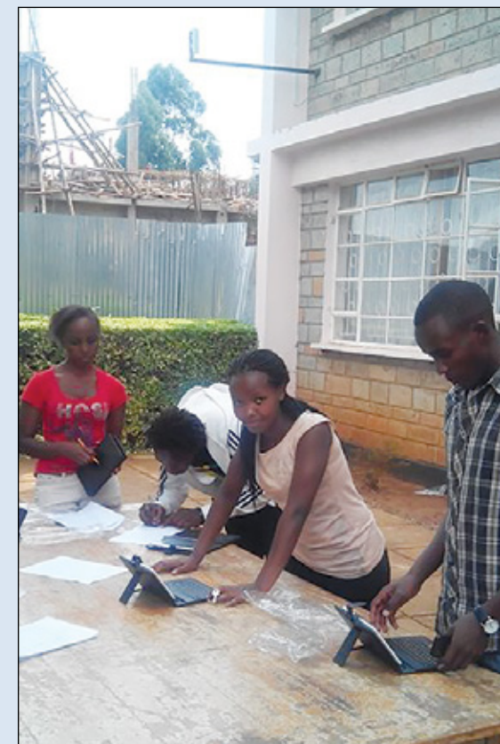
Moi University first-year students receive their Surtab Tablets