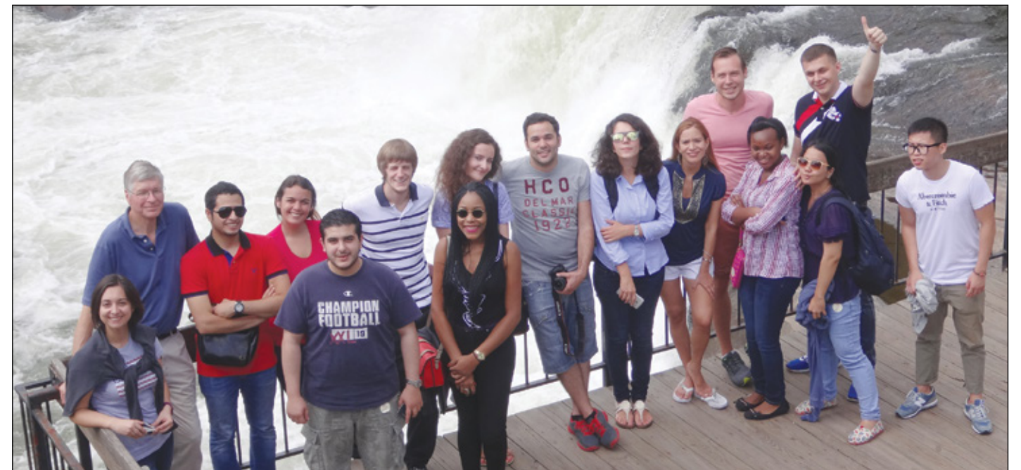
Class of 2015 enjoys a stop at Obiopyle before classes start