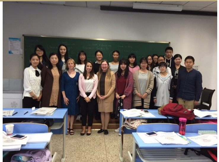
The Pitt Law team with their students at NPU in Xi'an, China