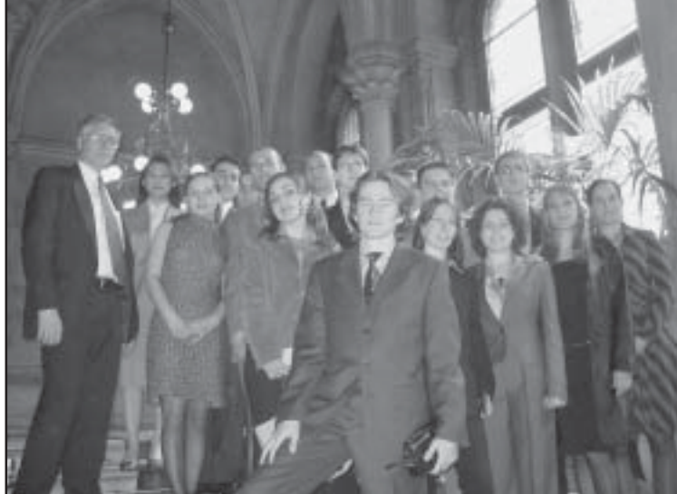
The five teams join for a photo in Vienna's Town Hall