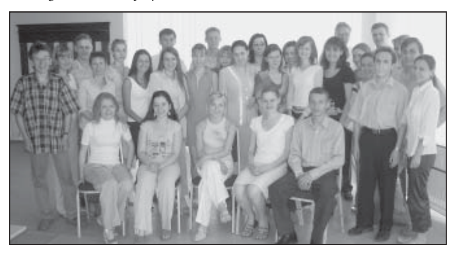
The DNU Summer School "Class of 2003"

summer school classes, these students are noticed by Pitt and DNU faculty and consistently go on to become more involved in both DNU academic life and the Pitt-DNU partnership.